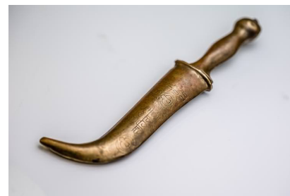
Kirpan (above and below)